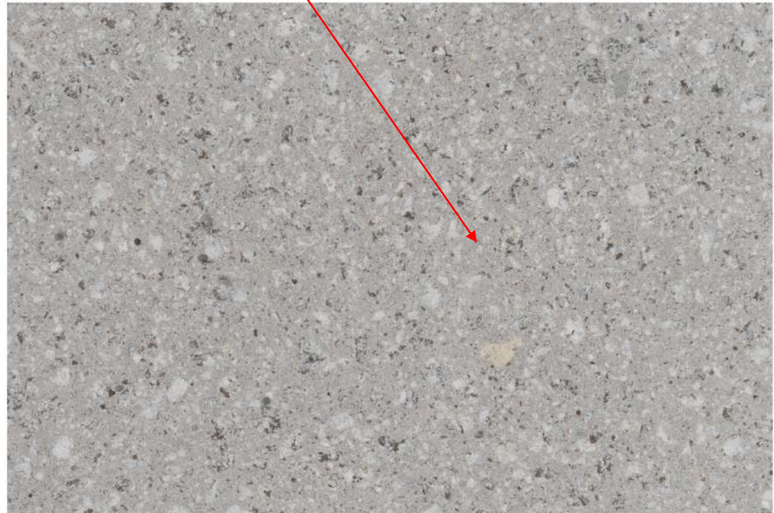
C155 B1000 GB