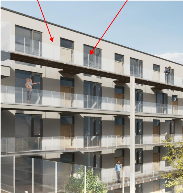
Detail of proposed phase 2 courtyard walkways

Powder coated Aluminum framed glazed curtain walling, windows and doors.