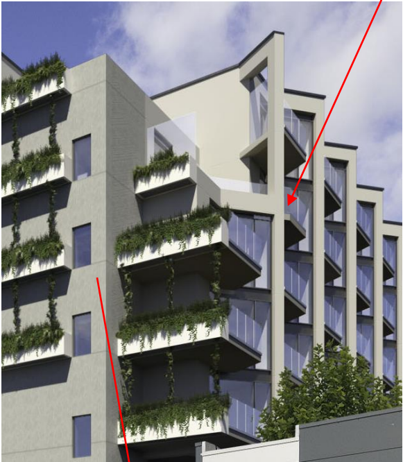
Detail of proposed phase 2 facade

White reconstituted Stone Panels - example Techrete