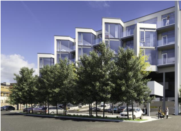
View of proposed phase 2 apartments north west elevation