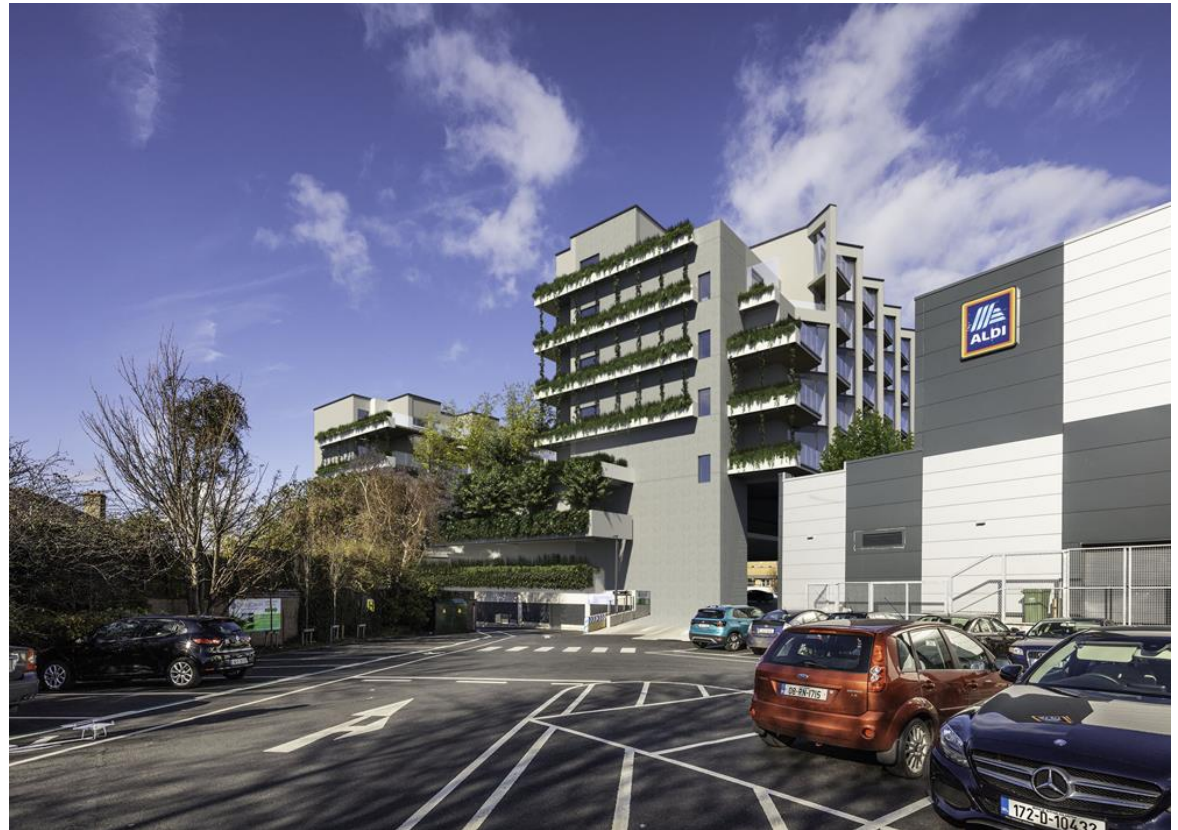
CGI VIEW FROM SOUTH EAST-PLANNING SCHEME

In addition the ‘green wall’ planting acts as screening and help to soften the massing of the elevations.