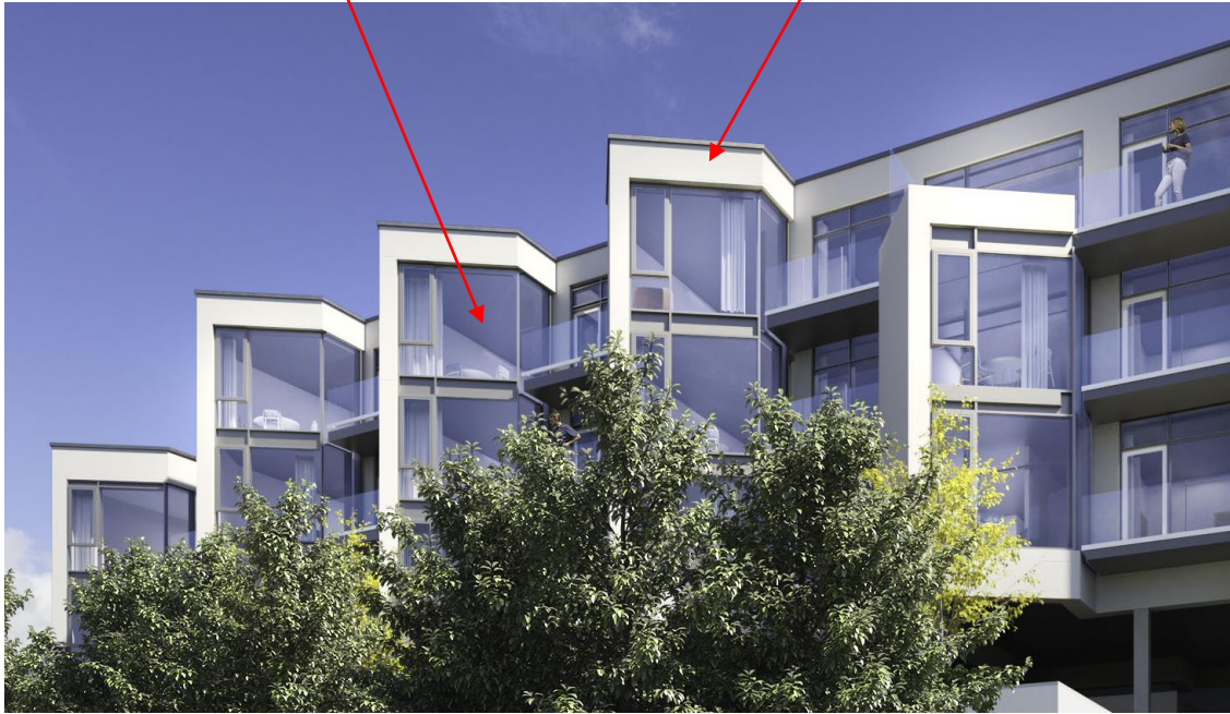
Detail of proposed phase 2 facade