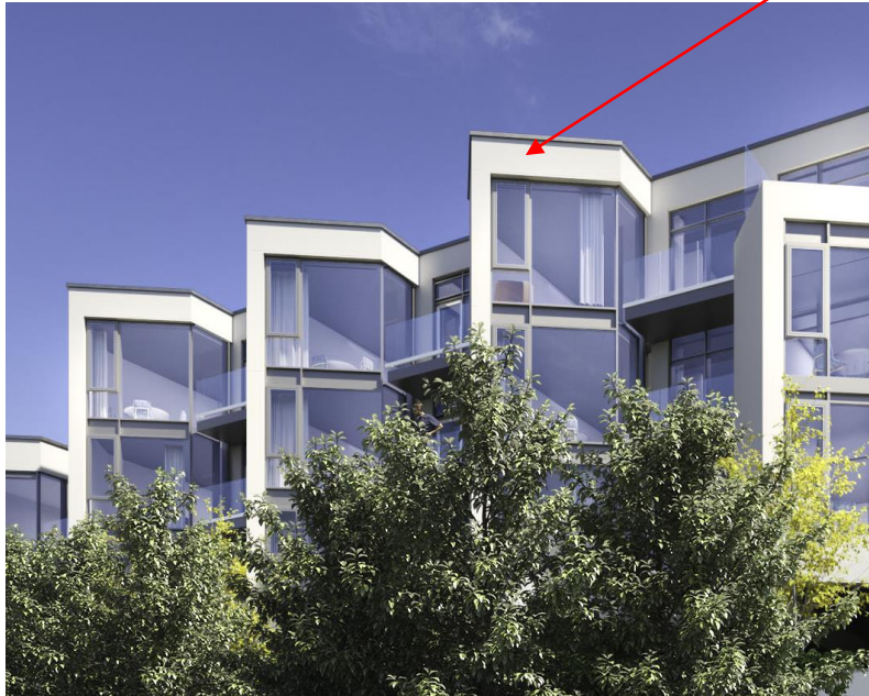
Detail of proposed phase 2 facade

White reconstituted Stone Panels - example Techrete