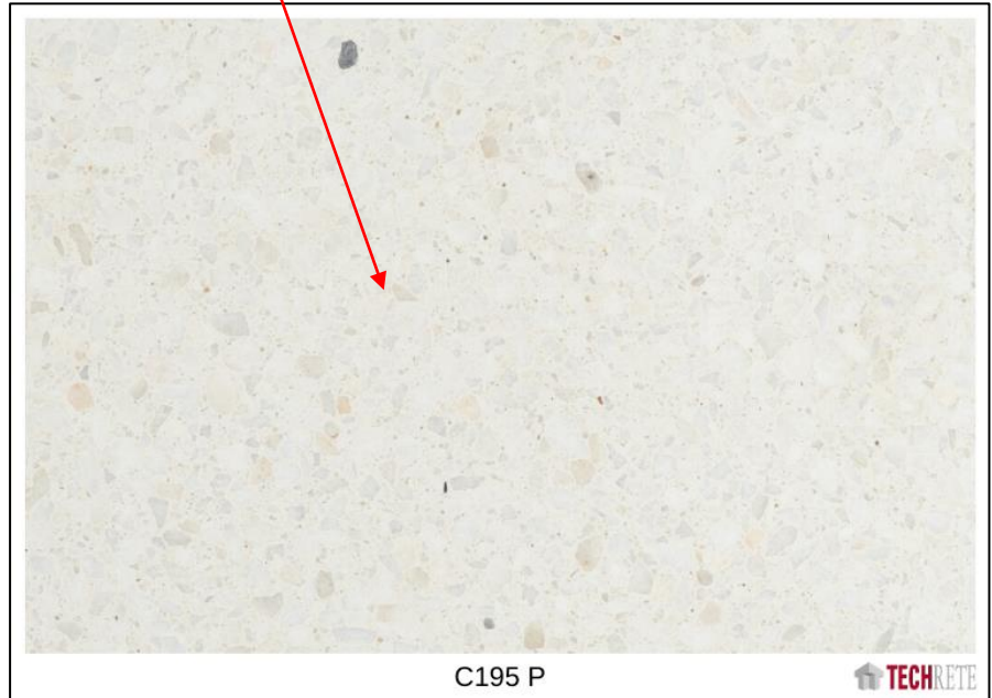
Sample panel of white reconstituted stone cladding proposed