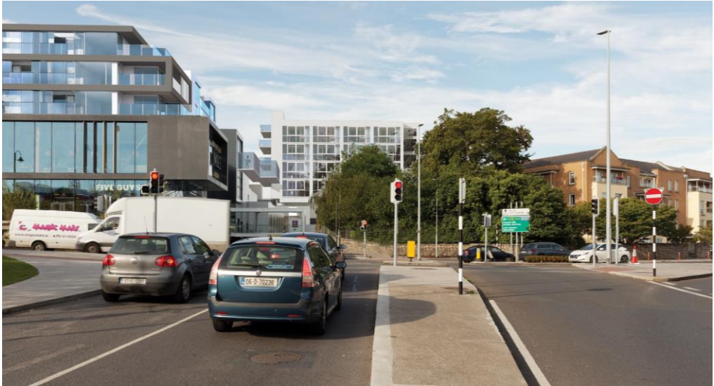
View of north east façade with permitted apartments facing onto Frascati Road and proposed additional phase 2 apartments set back over the existing car park decks

These proposed materials provide a high quality, durable and sustainable finish with a contemporary architectural character.