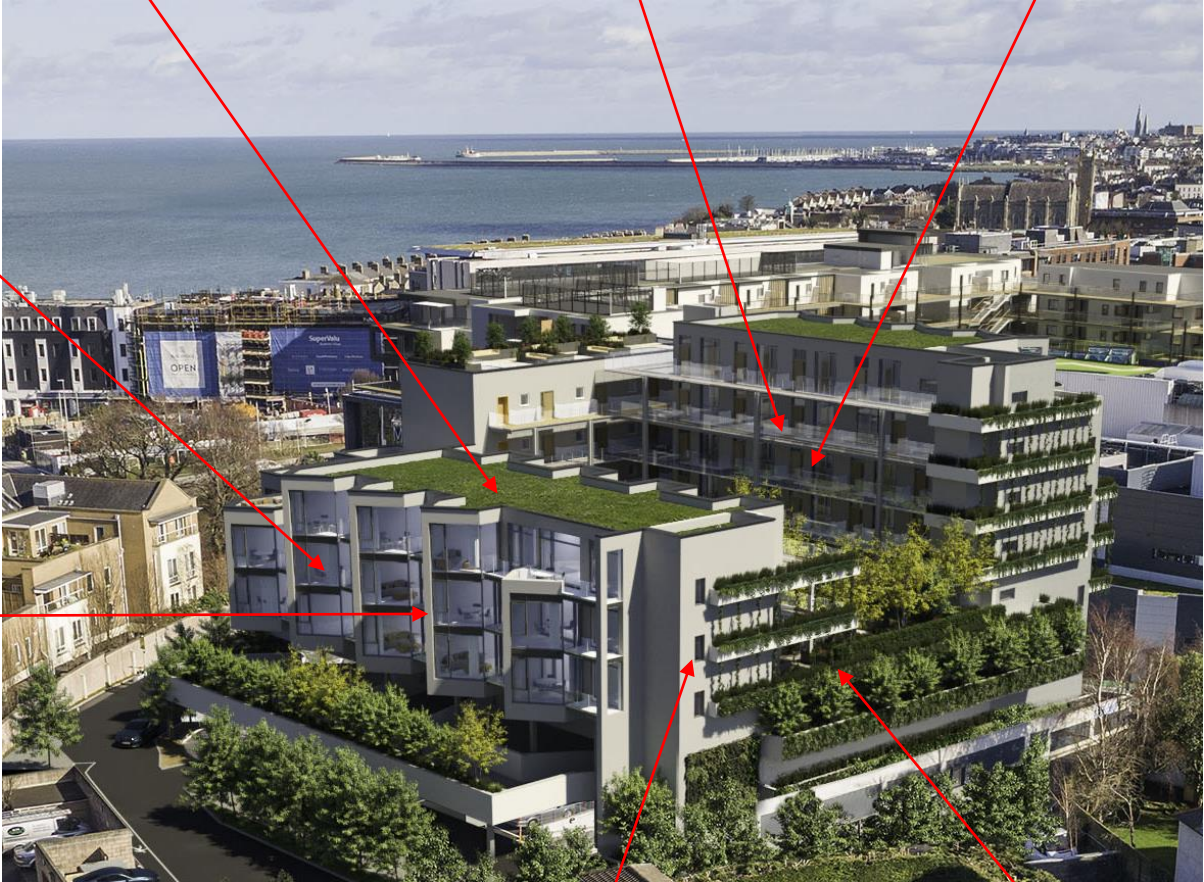
Detail of proposed phase 2 external finishes & materials

Exposed steel structure to external walkways with painted finish