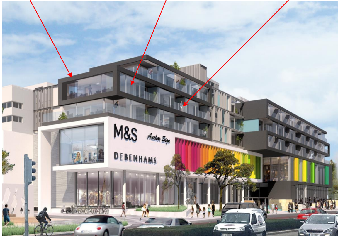
Detail of phase 1 permitted external finishes

Glazed balustrade guardings to balconies – winter gardens to be added