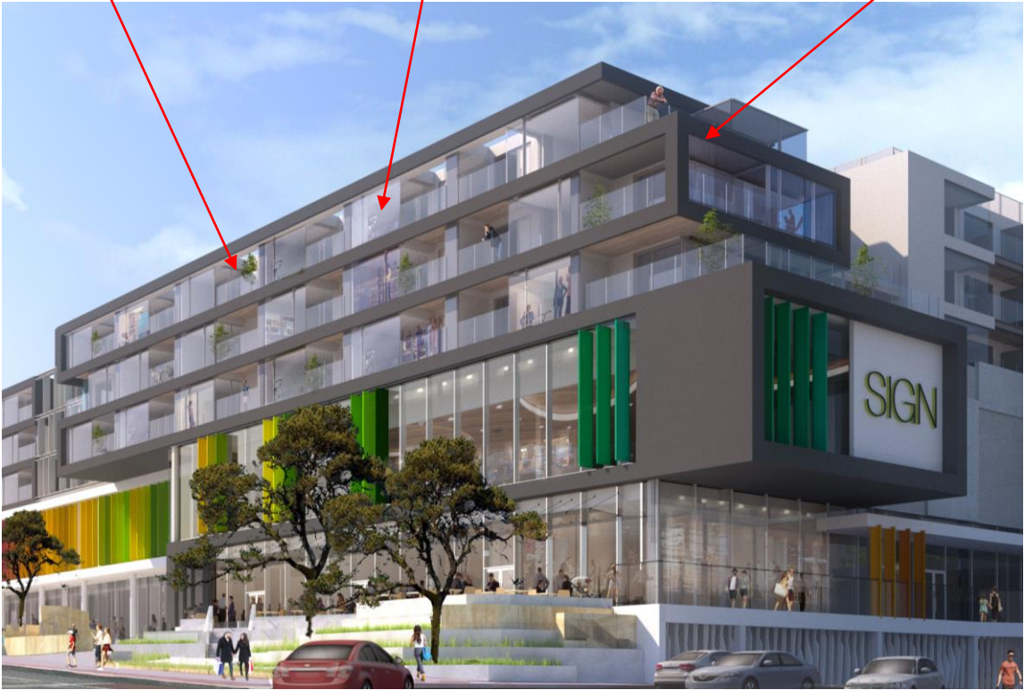
Detail of phase 1 permitted external finishes

Black reconstituted Stone Panels - example Techrete