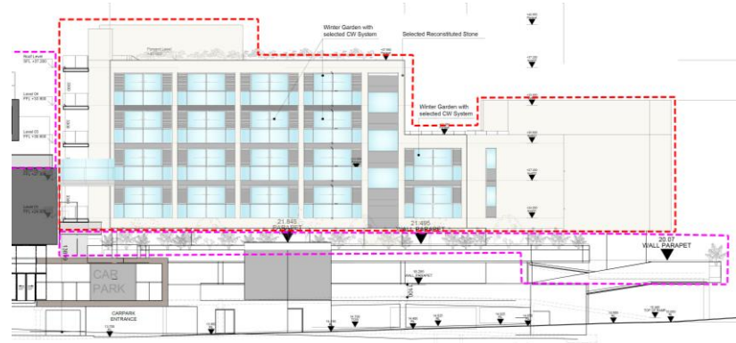
Extract proposed north east elevation to phase 2 studio apartments

These proposed materials provide a high quality, durable and sustainable finish with a contemporary architectural character.