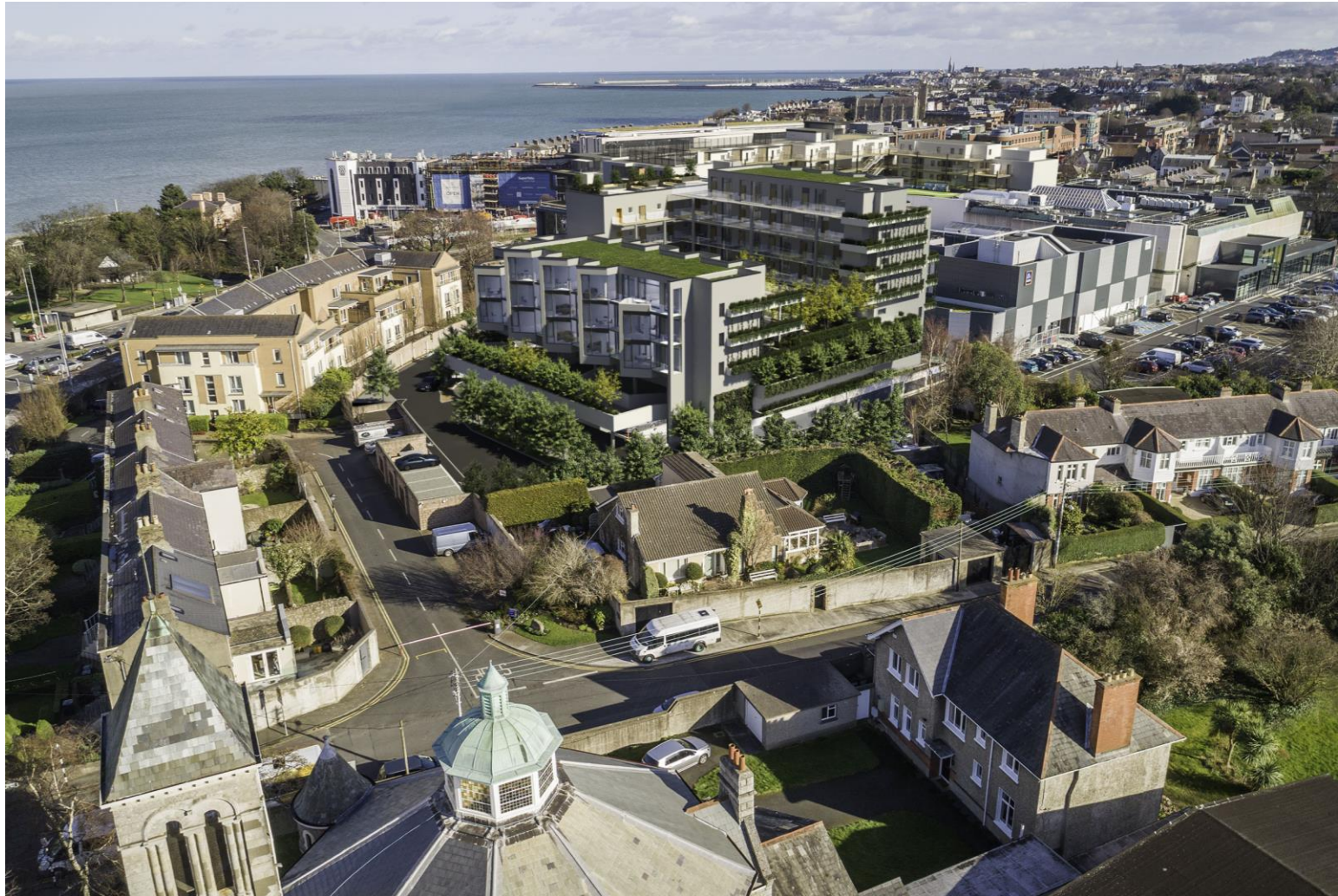
AERIAL CGI VIEW FROM SOUTH WEST– SHOWING LANDSCAPING & PLANTING PROVIDING SCREENING

Project: Proposed Strategic Housing Development at the Frascati Centre, Blackrock, Co Dublin Applicant: IMRF II Frascati Limited Partnership / Davy IMRF II GP Limited Date: 26 th August